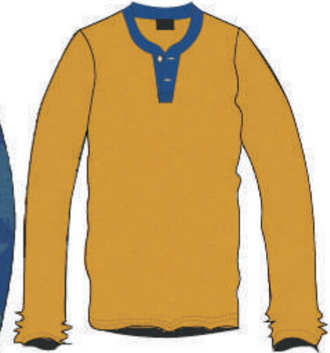
HENLEY LONG SLEEVE