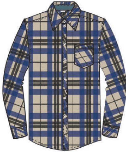
OXFORD PLAID SHIRT