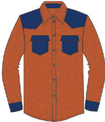
CUT & SEW PLAIN SHIRT