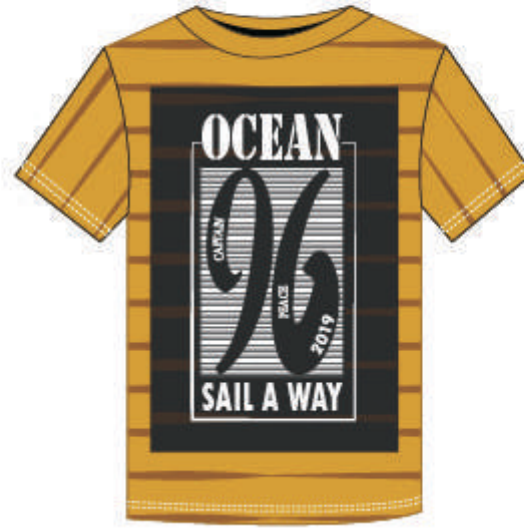
PHOTO GRAPHIC DESIGN TEE SHIRTS